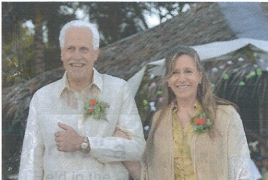
Truly a transitional picture taken before we left the Philippines

Appointees learn to build their support team, prepare communication tools, address finances, continue to meet Converge staff and much, much more!